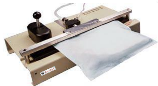
Fixture for 3 side sealed packs and pouches