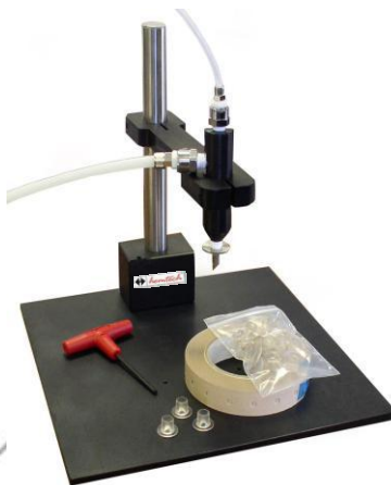
Probe for sealed packs and pouches