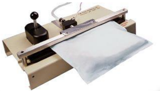
One side Open Package Test