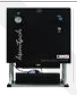
Tear Tester Elmendorf type