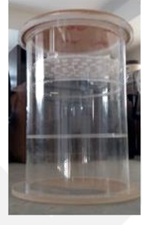
Large size Desiccator