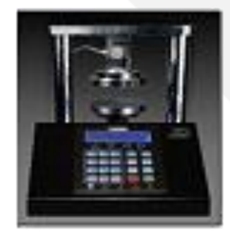
Bottle Compression tester For Top Load

Digital Timer Battery Operated Auto Hold Test end sensing