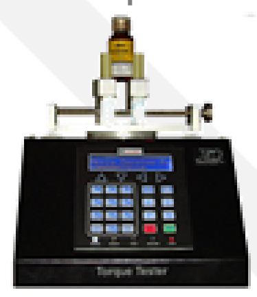
Micro-controller based Digital Operating Console with Key pad & LCD Calibration facility