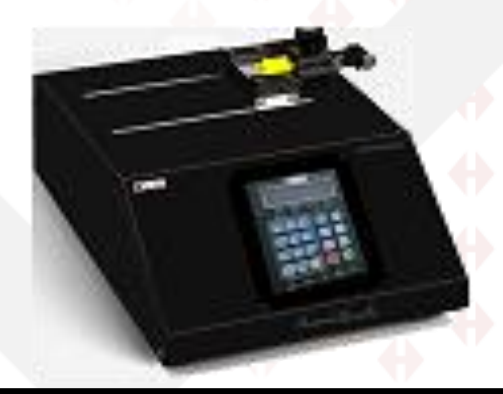
Dynamic Shear Adhesion Tester