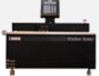
hemWIZARD – WINDOWS based Software for Control & Data Acquisition

Microcontroller based LCD Display & Keypad Micro-stepping / Servo Drives High Data Rate Built in RS 232 Interface