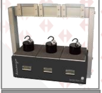
Shear Adhesion Tester