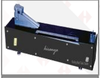
Tack Tester (Rolling Ball Type)