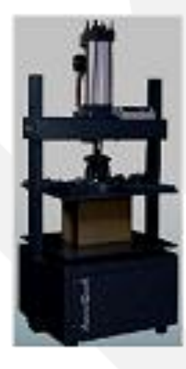
BOX Compression Tester

Digital Pneumatically Operated Accurate Force Measuring system