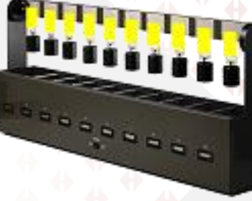
Shear Adhesion Tester