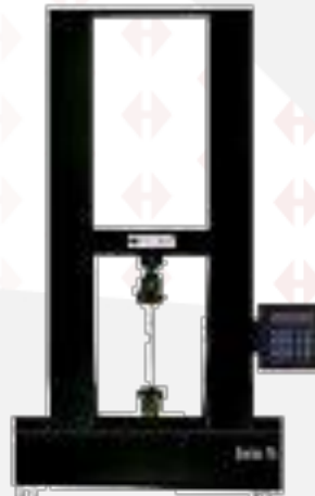
Series 16 500 to 5000 Kg