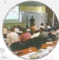
Training & Tech Support