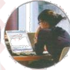
Retrofit & Computerisation