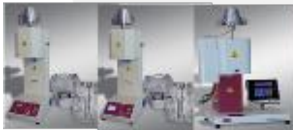
METHOD A METHOD A & B METHOD A & B Weight lifter