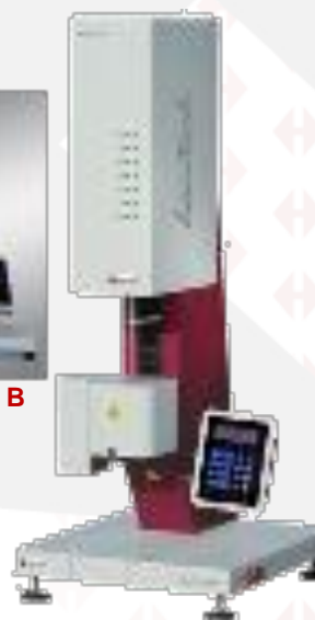
Full featured Model Method A & B + Rheology