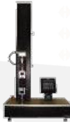
Series 7 10 to 500 Kg

hemWIZARD – WINDOWS based Software for Control & Data Acquisition