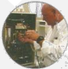
Repairs & Maintenance