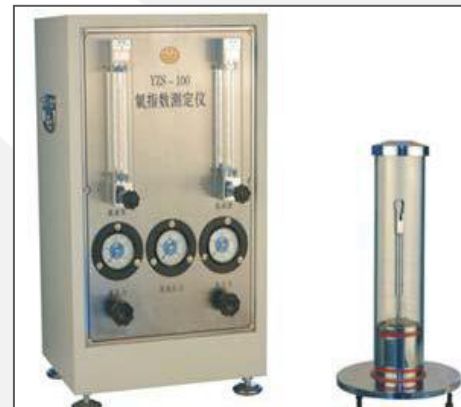
LIMITED OXYGEN INDEX