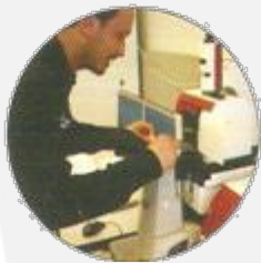
Installation & Commissioning