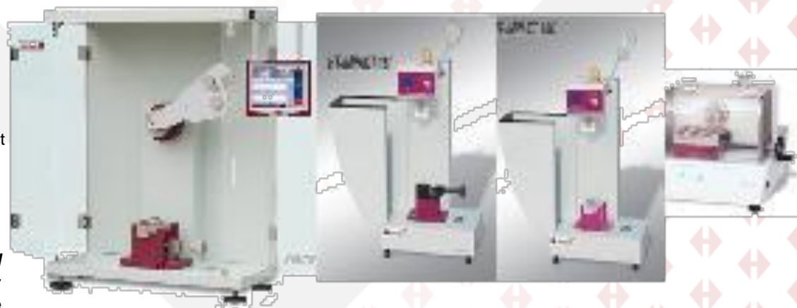
Unique Model Single Hammer Single Vice For IZOD & CHARPY

IZOD Impact Tester CHARPY Impact Tester IZOD + CHARPY Impact Tester