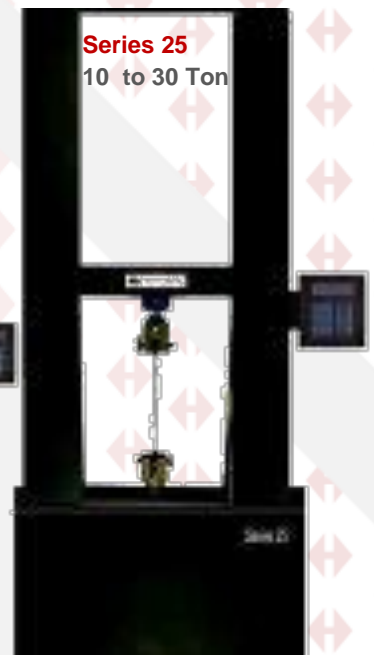
Series 25 10 to 30 Ton